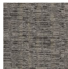
Riad 01518 LRV 12.5