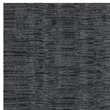
Crafted 01580 LRV 6.8