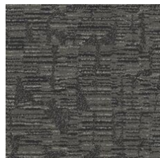
Blended 01555 LRV 8.8