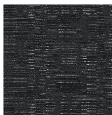
Medina 01505 LRV 4.5