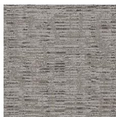
Wool 01105 LRV 19.2