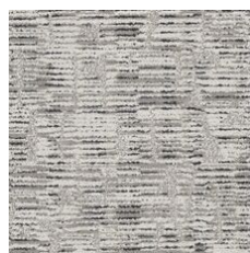
Argan 01100 LRV 32.4