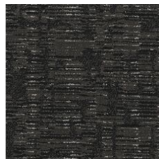
Henna 01585 LRV 3.8